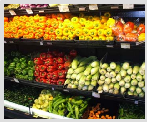
Access to full service groceries is one factor that contributes to overall community health