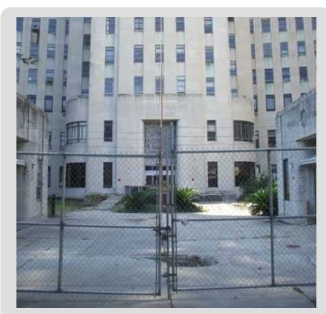
Planning is underway for a replacement facility for Charity Hospital

cally distant from medical care; emergency rooms remain overtaxed; and even with an estimated 11% decline in the region's population<sup>34</sup>, there remains a shortage of in-patient beds and medical services generally. Soon after Katrina, the Medical Center of Louisiana at New Orleans (MCLNO, operated by the LSU Health Sciences System) announced plans for a $1.2 billion facility in the downtown New Orleans area to replace the shuttered Charity Hospital.35 Leaders of the initiative announced that the hospital would be built according to the operating model of MCL-Shreveport, a hospital that cares for both the indigent and the insured by offering a wide range of top notch specialty services. While MCLNO's proposal has been met with enthusiasm for the most part, concerns have been raised both