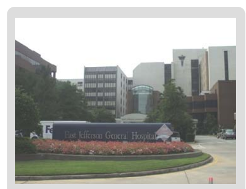
East Jefferson has recently announced a partnership with the M.D. Anderson Cancer Center in Houston

• In 2008 East Jefferson General Hospital launched a partnership with the renowned M.D. Anderson Cancer Center in Houston to provide its cancer patients with access to the best treatment protocols and processes developed by one the world's most respected leaders in cancer care.