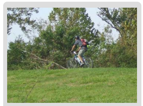
A healthy lifestyle, including frequent exercise, is a well documented way to improve health outcomes

changes can singlehandedly improve the health of our residents. Nonetheless, there is an impressive body of recent research that directly connects environmental factors, such as those listed above, with significantly improved health outcomes. For instance, a recent article in the American Journal of Health Behavior cited several environmental factors as barriers to changes in behavior, including inaccessible health promotion programs and safety concerns involving crime and traffic. <sup>28</sup> Additionally, it has been suggested that heart disease and stroke can be substantially reduced through social and environmental factors that mitigate risky behaviors such as physical inactivity and poor diet. <sup>29</sup> At the state level, programs such as the "Louisiana Two Step" ad