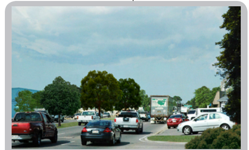
Jefferson Highway, without above ground utilities and large signage and with additional street trees

JEDCO Jefferson Parish Economic Development Commission