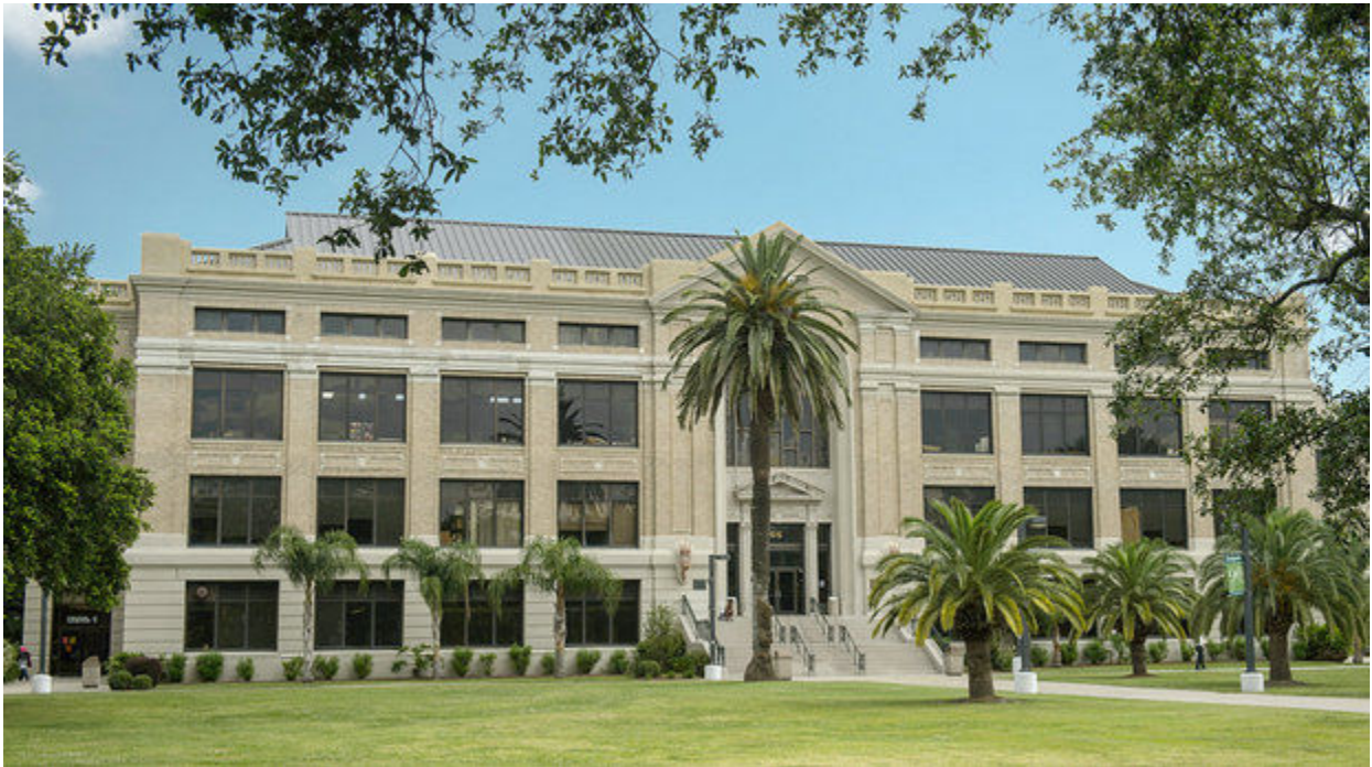
Isaac Delgado Hall, at the Delgado Community College campus near City Park. The college announced plans to build a $15 million dollar campus on the West Bank in Jefferson Parish.